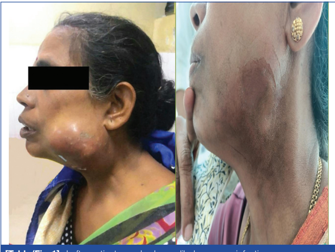
[Table/Fig-1]: Left masticator and submandibular spaces infection. [Table/Fig-2]: After recovery from the infection. (Images from left to right)

Complete blood picture showed leukocytosis with a count of 16,930 cells/cu mm. Erythrocyte Sedimentation Rate (ESR) was 25 mm/hour. Gram stained smear viewed under conventional compound microscopy revealed occasional pus cells and gram positive cocci. Culture yielded no growth after 48 hours of aerobic incubation. Dental examination on day five revealed deep dental caries with apical periodontitis in the lower left 1<sup>st</sup> and 2<sup>nd</sup> molars for which extraction was advised. Patient was discharged on the 6<sup>th</sup> day with an oral antibiotic-cefixime and potassium clavulanate (Tab. Gramocef CV 325 mg BD) and an analgesic-aceclofenac and paracetamol (Tab. Hifenac P 425 mg) which continued from day four for five more days. The patient was diagnosed with left masticator and submandibular spaces infection and is fine on a follow-up of one and a half years [Table/Fig-1,2].