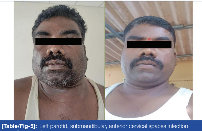
[Table/Fig-6]: After recovery from the infection. (Images from left to right)

The patient was discharged with an oral antibiotic-cefixime with potassium clavulanate (Tab. Gramocef CV 325 mg BD) and an analgesic-aceclofenac with paracetamol (Tab. Hifenac P 425 mg BD) for seven days. Gram stained smear viewed under conventional compound microscopy reported pus cells with gram positive cocci and gram negative coccobacilli. Culture yielded no growth after 48 hours of aerobic incubation. The patient was diagnosed with left parotid, submandibular and anterior cervical spaces infection extending upto the thorax and is fine on a follow-up of six months [Table/Fig-5,6].