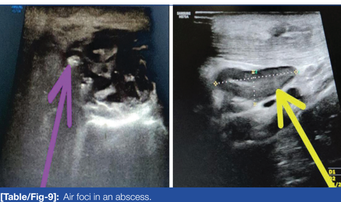
[Table/Fig-9]: All foci if all abscess. [Table/Fig-10]: Cervical lymphadenopathy in an abscess. (Images from left to right)